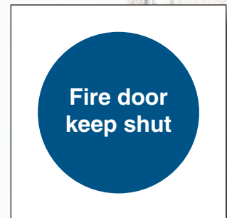
80 x 80mm Text height = 4.5mm