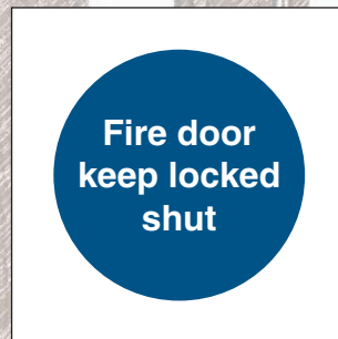
80 x 80mm Text height = 4.5mm