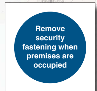
100 x 100mm Text height = 4.5mm