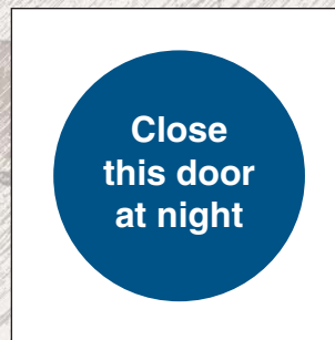
80 x 80mm Text height = 4.5mm

Mandatory fire safety notices made from Photoluminescent materials have the added benefit of being visible in both the light and the dark. A minimum of class C performance should be specified.