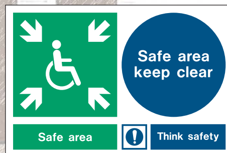
300 x 200mm Text height = 6mm / 5%*

Refuges and evacuation lifts should be clearly identified by appropriate fire safety signs. Where a refuge is in a lobby or stairway the sign should be accompanied by a blue mandatory sign worded “Refuge – keep clear”.