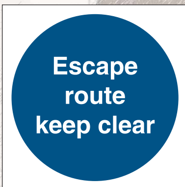
200 x 200mm Text height = 14mm

There are specific Mandatory Fire Safety Notices to reduce the risk of escape routes / Fire exits becoming blocked or obstructed. Typically larger format than conventional fire door notices as they are commonly placed on exterior doors which require greater viewing distances.