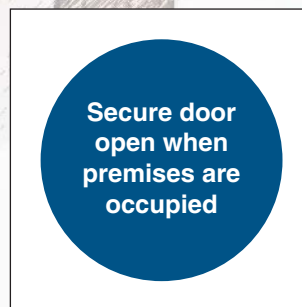
100 x 100mm Text height = 4.5mm