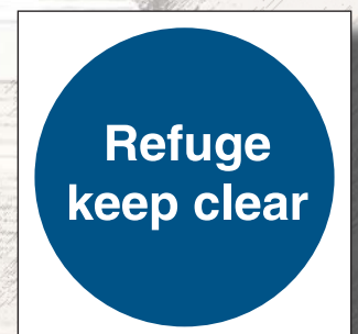
200 x 200mm Text height = (16)6mm / 5%*