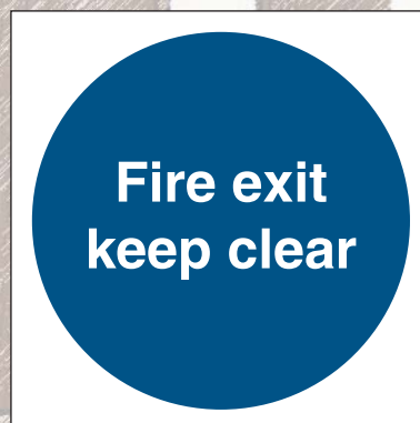
200 x 200mm Text height = 14mm